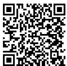
Exhibit Hall Booth Rental: $100 (includes one registration)

Professionals / Practitioners: $150 (Contact Hours optional with secondary registration through Heartland AEA)