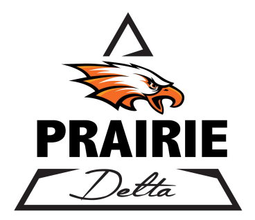
Location: Kirkwood Community College Campus